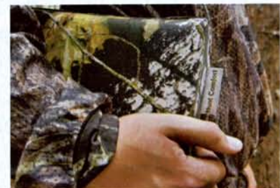
The cover of a cushion should be waterproof to protect it from the weather.

Going into a retail store, pulling a cushion off the shelf and squeezing it is not the best way to select a