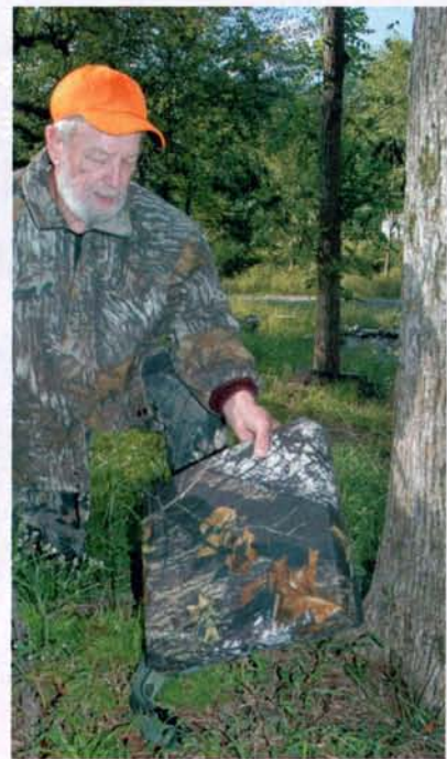
Sitting still doesn't have to be uncomfortable — spend a little more on a good cushion and you'll appreciate the investment.

cushion you might spend hours sitting on in the woods. When you simply squeeze them for a moment or two, they all feel good. The best way to select a hunting cushion is to sit it on a hard surface, such as a concrete floor, and sit on it for a period of time. Most of us do not have that much time when shopping and do not want to be seen sitting on the floor of a retail store. That being the case, use the knee test. Place the cushion on a hard floor and kneel down on one knee and place all your weight on it. You should not be able to feel the floor through the cushion.