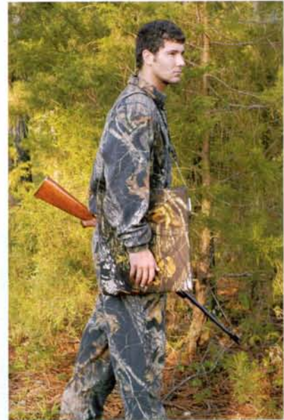
A good cushion should be easy to tote and be made of high-quality foam, and it might have a layer of gel padding for extra comfort.

According to Robinson, Hunt Comfort cushions, such as the FatBoy, are made from two layers of quality medical-grade polyurethane open-cell, highly resilient foam. The outer layer is made from one-inch Intelligel gel. The foams work in conjunction with the gel surface to provide even support and a comfort feel. The cushion is covered with a waterproof fabric